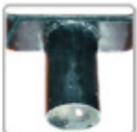
Poll Mounting Bracket

Street Lights | Cove Lighting | Conference/Meeting rooms Commercial Complexes | Schools | Colleges & Universities Residential/Institution | Buildings | Factories & Offices Cineplexes | Hospitals Hotels